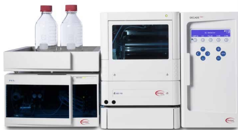
Fig. 1. ALEXYS Neurotransmitter Analyzer

The ALEXYS Neurotransmitter Analyzer (Fig. 1) consists of a P6.1L pump with integrated degasser, DECADE Elite electrochemical detector, AS 110 autosampler and Clarity data acquisition software. The LC-ECD conditions are listed in Table 1. After separation on a C18 UPLC column, the neurotransmitters were detected in DC mode on a glassy carbon working electrode using a DECADE Elite detector in combination with a SenCell wall-jet electrochemical flow cell [5]. An example chromatogram of insect neurotransmitters is shown in Fig. 2. The detection limit is around 0.5 nM for a 5 \mu L injection.